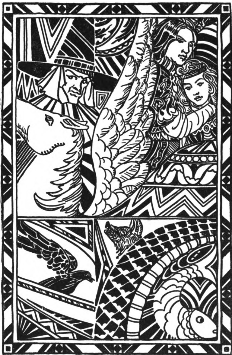
The Old Woman of the Mountain and the Wonder Horse